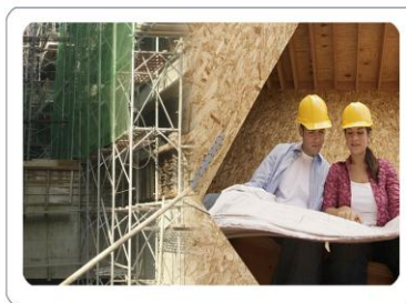
Construction Site Time Attendance